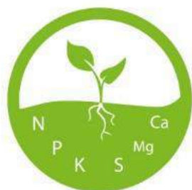
OPTIMISED ON-FARM NUTRIENT RECYCLING