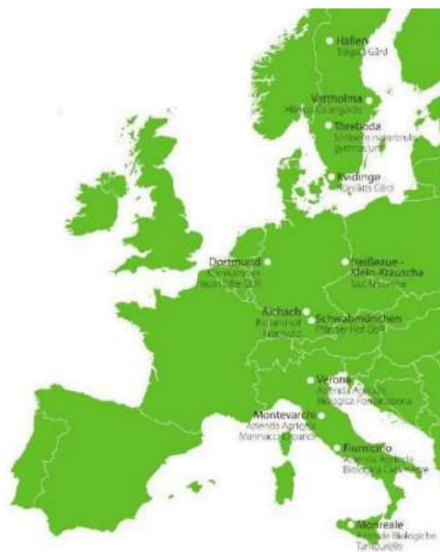
Map 1: The 12 SOLMACC demonstration farms

12 motivated organic farmers across Germany, Italy, and Sweden, with four farms in each of the three countries (see Map 1) were part of the SOLMACC demonstration network for climate-friendly and resilient practices. The farmers contributed land, equipment, and labor, and shared their experiences of applying newly-acquired knowledge for climate change mitigation and adaptation in the EU.