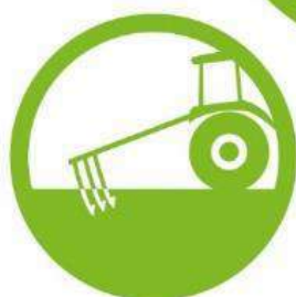
OPTIMISED TILLAGE SYSTEM